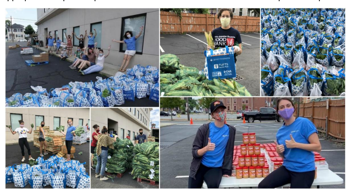
Pictured are staff and volunteers at the Revere Mobile Market.

In addition, the CHA Primary Care team rapidly built a robust system to manage COVID positive/presumptive positive patients in the community by connecting them to food insecurity community-based organizations. With the new system, COVID-19 positive patients experiencing food insecurity are flagged (with consent) and connected to the appropriate nonprofit to provide two weeks of free food aid to cover the quarantine period.